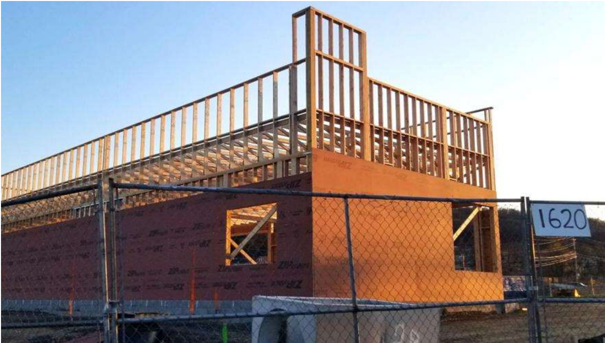
A Taco Bell eatery is under construction at 1620 E. Fourth St. in south Bethlehem.